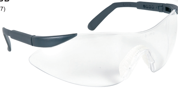
EVA86 / EVA86AB (EN170: 2C-1.2)